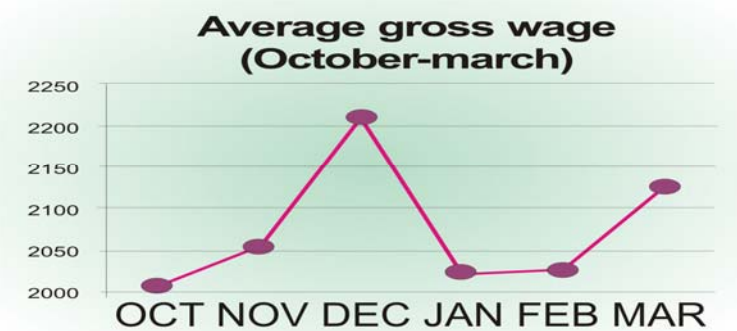
Figure 2 Average gross wage

For the month of February 2012 nominal net average earning was 1,472 Lei. This amount represents an increase of 4.1 percent compared to February 2011.